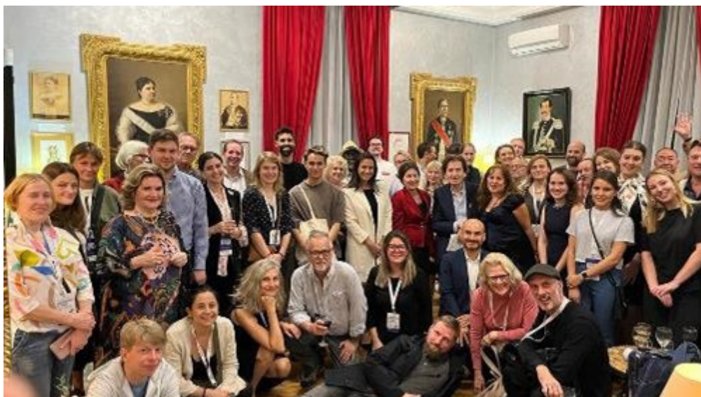
Conference participants at the House of Jevrem Grujić

The evening reception was held at the House of Jevrem Grujić where participants were greeted by the owner Mr Lazar Šećerović. The house was the first heritage building designated by the Cultural Heritage Protection Institute of the City of Belgrade in 1961. The descendants of Jevrem Grujić, a prominent figure of Serbian 19th century diplomacy, still live in this house and the life and work of members and descendants of the Grujić family are associated with the important political and social events in Serbia.