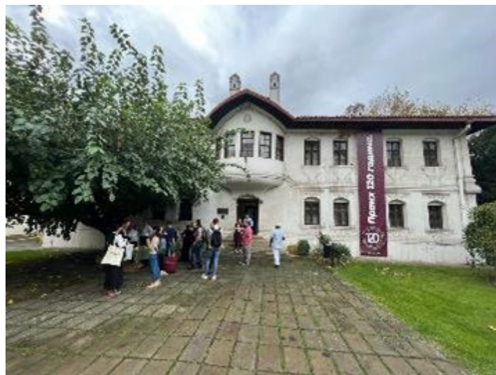
The Princess Ljubica Residence

We again changed location for the last day of the conference, decamping to the Princess Ljubica Residence for the annual DEMHIST (hybrid) General Assembly and tours of the house. Princess Ljubica's Residence is a palace located in Belgrade, designated a Monument of Culture of Exceptional Importance. In 1829 Prince Miloš Obrenović decided that it was time to build a new residence in place of the old palace across the way. The residence is one of the most remarkable buildings among the preserved examples of civil architecture in the first half of 19th century Belgrade, built according to the ideas and under supervision of Hadži-Neimar, the pioneer of Serbian building and construction. Constructed in 1829-30, Prince Miloš planned that the residence would have a twofold purpose – to be a home for his family, Princess Ljubica and his sons Milan and Mihailo, later rulers of Serbia, and also a residential palace. The General Assembly was for DEMHIST members only, other conference participants were able to enjoy a tour of The Cathedral Church of St. Michael the Archangel and visit the Serbian Orthodox Church Museum. At the General Assembly, everyone came together for a tour of the Residence given by the curator of the Belgrade City Museum Dušan Jovanović.