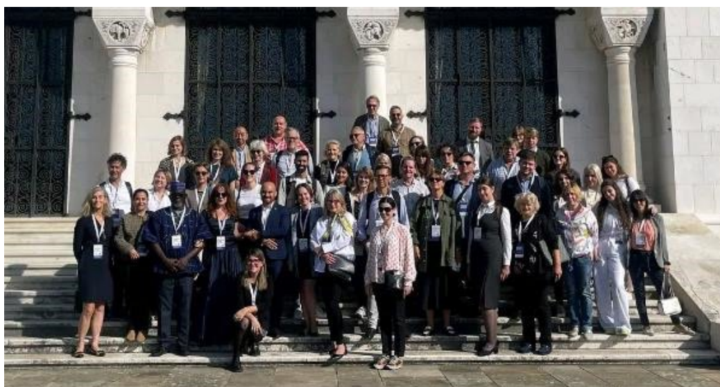
Conference participants at the Royal Compound