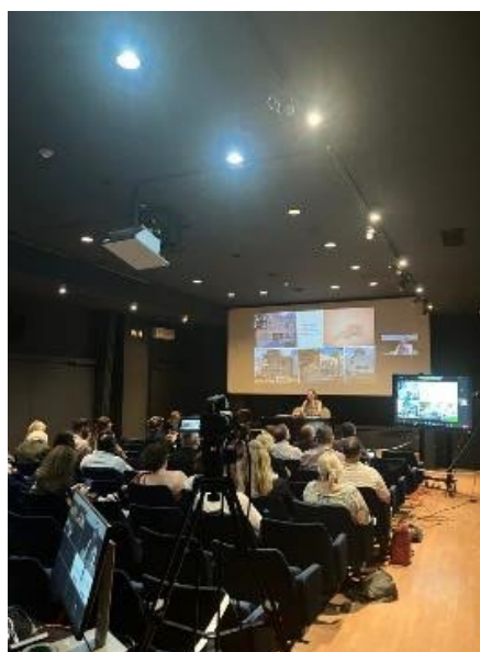
Learning about Belgrade, on foot and in the lecture hall